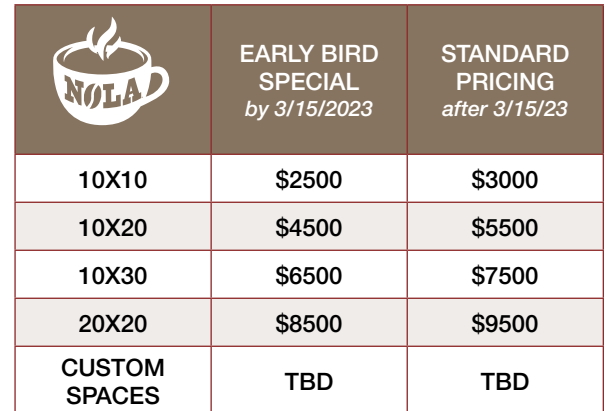
Exhibit space reverts to standard pricing after 3/15/23 and payment is required to complete your reservation. Exhibit floorplan will be closed as of 8/1/23 and additional space allocation is not guaranteed after that date. Above prices covers cost of booth space as: piping, drapes, 6 ft table and two chairs. Additional service options available through the show general contractor/decorator Alliance Expo Services. Are you applying as a Non-Profit? (Table space and price varies. Terms available from Executive Management).

Q. Will you plan to serve coffee/beverage samples (3oz limit)? yes no